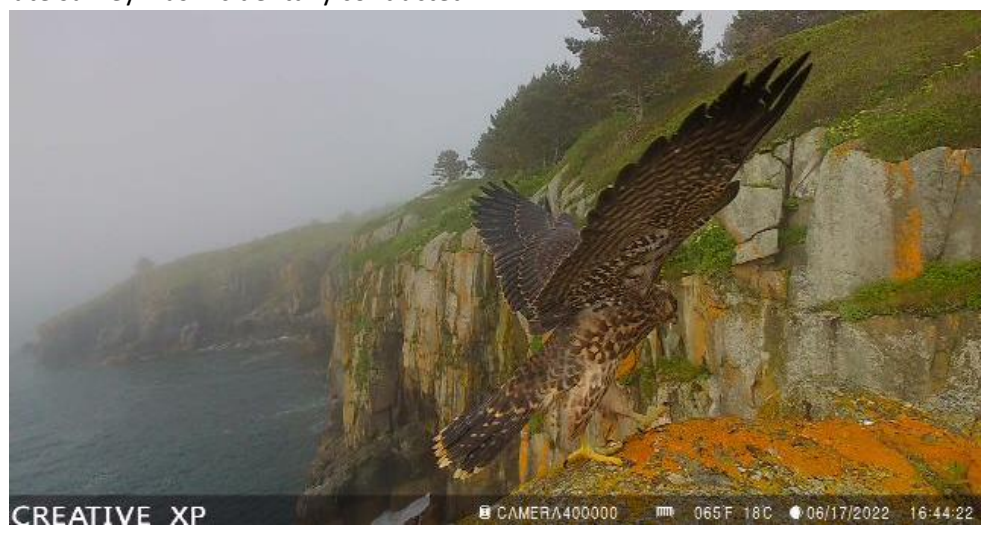
Cellular game camera photo courtesy of Linda Welch, USFWS