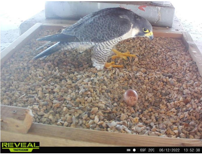
Cellular game camera photos