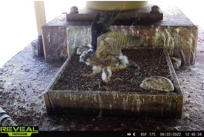
Cellular game camera photos